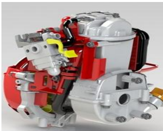
Fig. 1. Honda GX 25

From the perspective of understanding the context of the statistical evaluation of measured data itself within the amplitude and frequency of the engine Honda GX 25 (Fig.1) during the application of the statistical model may experience irregularities such as: is the liner regression model suitable, how much percent of the measured data of the statistical model can be explained by this model, how much percent of the model is strong, are the measured data affected by the multikolinearity, autokorelation or heteroscedasticity, is ensured by the normality of residues, what are the possible errors of the model and how to find out. These questions very resolutely answered by the methodology which the procedure is described in this work. To have these questions answered by the correct application of the linear regression model with two variables is effective using R-studio software [1, 2].