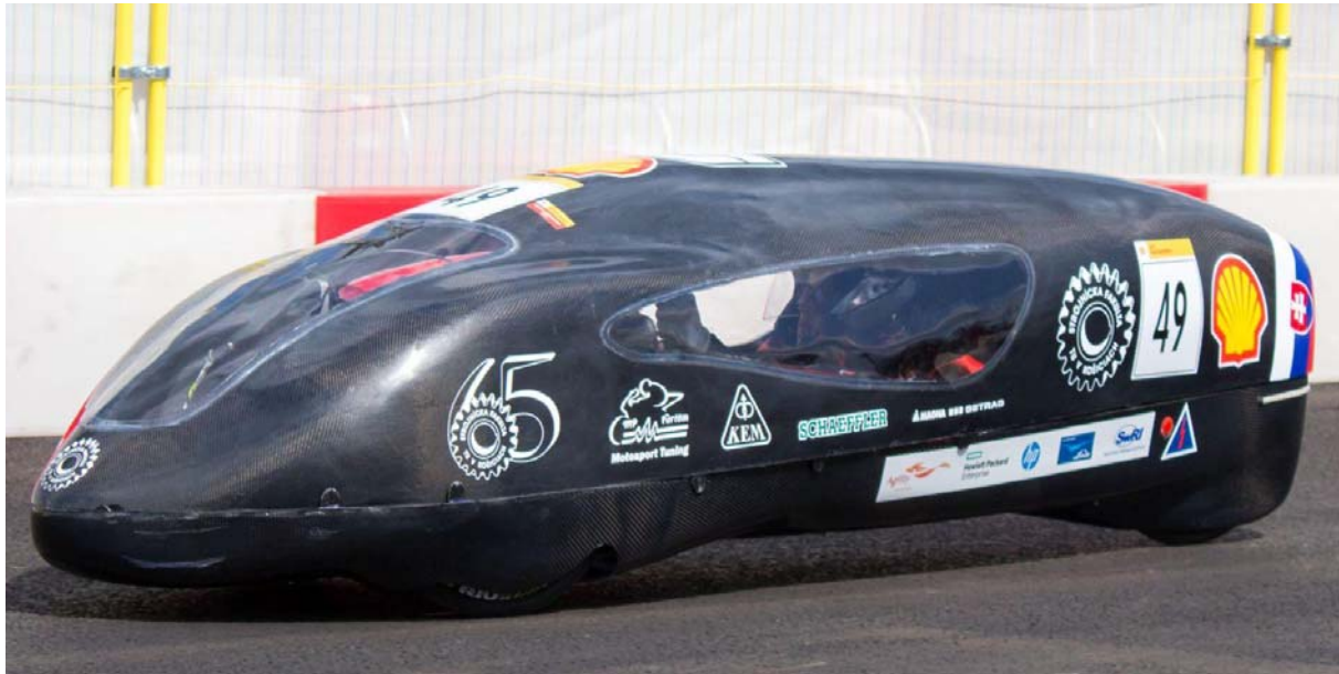
Fig. 4 Experimental vehicle during the international competition Shell Eco-marathon in London