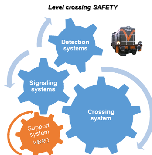
Fig. 3. Fundamentals and support of level crossing safety